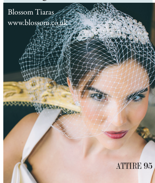
Blossom Tiaras www.blossom.co.uk