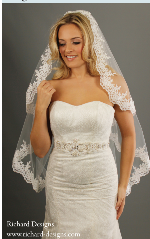
Richard Designs www.richard-designs.com