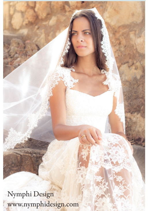
Nymph Design www.nymphdesign.com